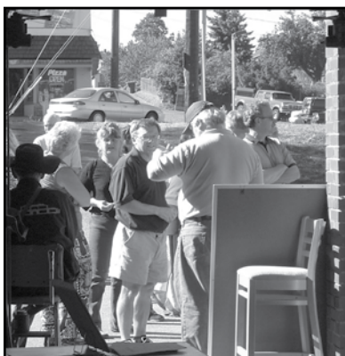
Members and people wanting to join the Society started gathering early. This year 14 new members joined at the Members Only function.

It's time to open the doors for the Members Only event. . .