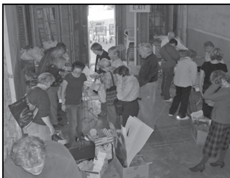
After a couple of hours of looking, shopping and having appetizers, punch and wine, members line up at the cashiers' tables to buy their selections.